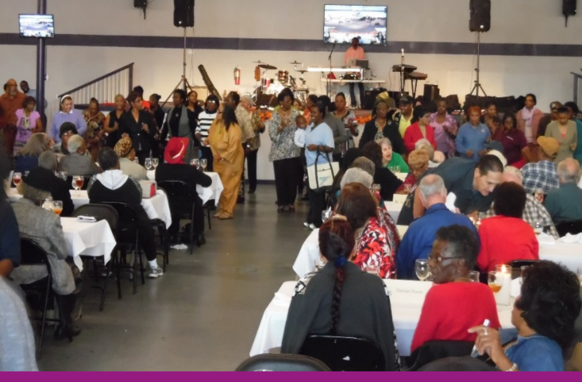
Resilience through music and dance